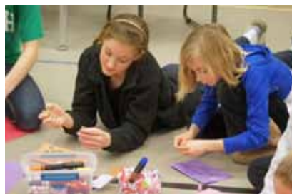
Students enjoy games and crafts at a recent youth group.